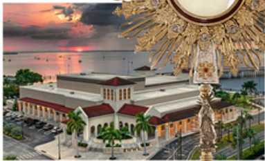
Charlotte Harbor Convention Center Punta Gorda, FL